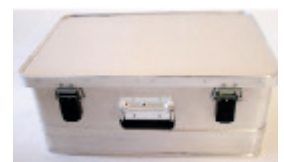
Example of storage vessel

At least one fire extinguisher (ABC 6 kg) and one fire blanket (complying with EN 1869 standard) should be kept available at all times. Furthermore, flammable materials may not be kept in the immediate vicinity of the exhibit. All floors and rear/side walls in the direct vicinity of the exhibit must be made of non-flammable materials. Ethanol fireplaces may not be placed directly at the edge of stands. Please consult the Technical Event Management department (V 31) with regard to the required positioning within the stand area. Only the daily requirement of flammable liquids may be stored at the stand.